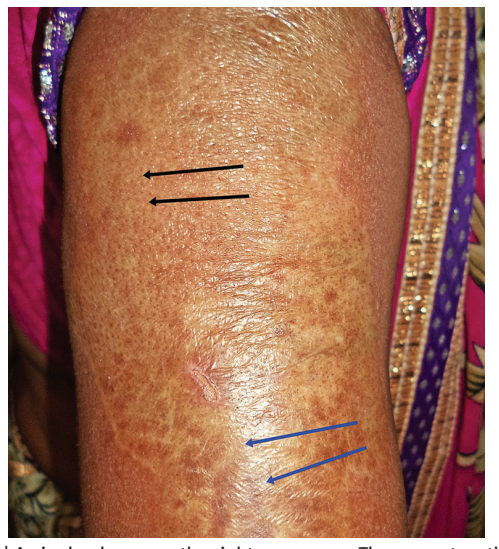
Figure 1a | A single plaque on the right upper arm. The upper two-thirds of the plaque show areas of follicular plugging (black arrows) whereas the lower third is smooth, shiny, wrinkly, and atrophic with areas of hypopigmentation (blue arrows). The site of intramuscular injection is visible.

rum biochemistry were within the normal range. Blood glucose levels were within normal limits. Antinuclear antibody, antisingle-stranded DNA antibody, anti-histone antibody, and antitopoisomerase-11a antibody were negative. Investigation for rheumatoid factor was unremarkable. Thyroid function tests including anti-thyroglobulin antibodies were within normal limits. Serology for Borrelia was negative. Skin biopsy was obtained from both the regions of the plaque (the upper two-thirds and lower third). The upper portion showed flattening of the epidermis, basal cell vacuolization, atrophy of the rete ridges and follicular plugs, and a mononuclear inflammatory infiltrate in the papillary dermis consistent with the diagnosis of LSA (Fig. 2). Biopsy of the smooth shiny lower portion showed normal epidermis with thick homogenized collagen bundles and a sparse infiltrate throughout the dermis with adnexal structures trapped deep in the dermis, supporting the diagnosis of morphea (Fig. 3). Based on the clinical and histopathological characteristics, a diagnosis of morphea and LSA in the same plaque was made.