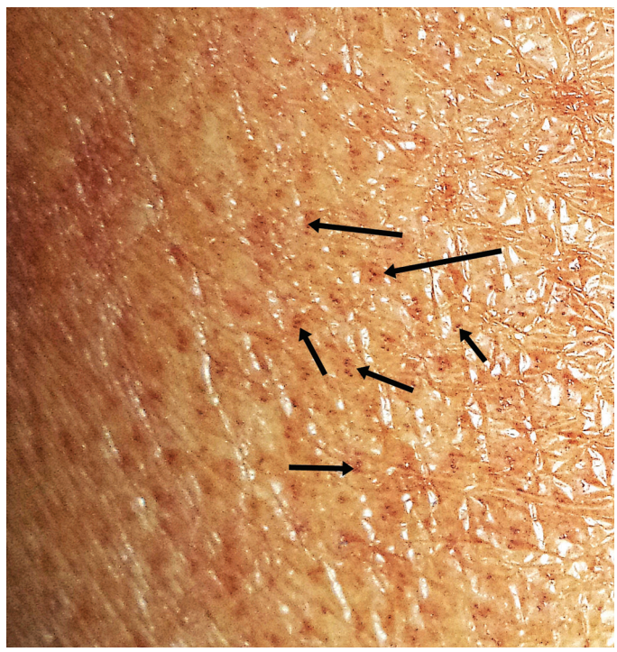
Figure 1b | Dermoscopy showing follicular plugging (black arrows) in the upper two-thirds of the plaque.