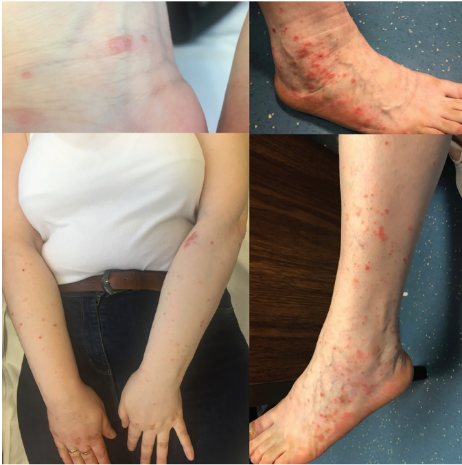
Figure 1 | Scaly erythematous papules on the flexor wrist, dorsal foot, forearms, and legs.

weeks, acitretin 25 mg/day was commenced alongside with topical mometasone furoate ointment. The patient received acitretin during a 6-month period, and complete regression of the skin lesions was achieved. At the routine follow-up visit, CT scans of the chest and abdomen and a brain MRI showed no signs of the disease. The skin lesions were in complete remission.