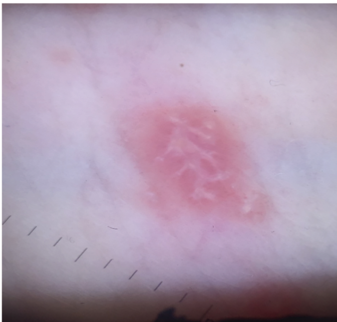
Figure 2 | Dermoscopic photo of the skin lesion: fern-leaf appearance on an erythematous background with white pearly structures corresponding to Wickham's striae, one of the main clinical features of lichen planus.