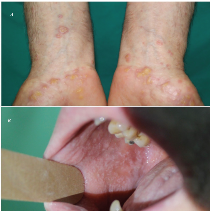
Figure 4 | A) Scaly, erythematous papules on the flexor wrists; B) fine web-like white lines on the buccal mucosa.